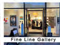
Fine Line Gallery