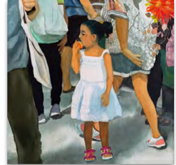
Apples and Oranges , watercolor, 26" x 27", Ruth Ellen Hoag, at Voice Gallery, La Cumbre Plaza.