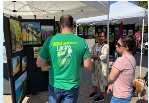
It was a lucky day for everyone, first that we enjoyed sunshine!