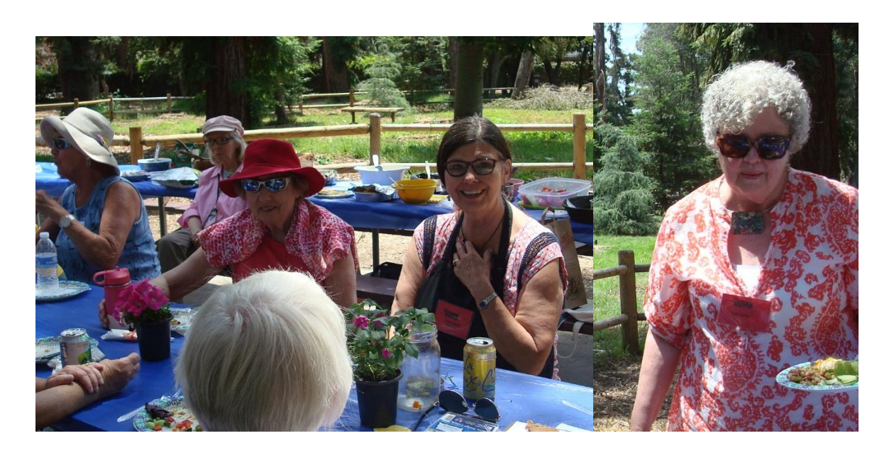
A great day was had by all. Artists make the best friends!