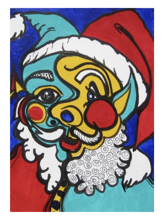
"Picasso's Elf" by Adria Abraham

10th Annual Picassos 4 Peanuts Show - 2020 Style.