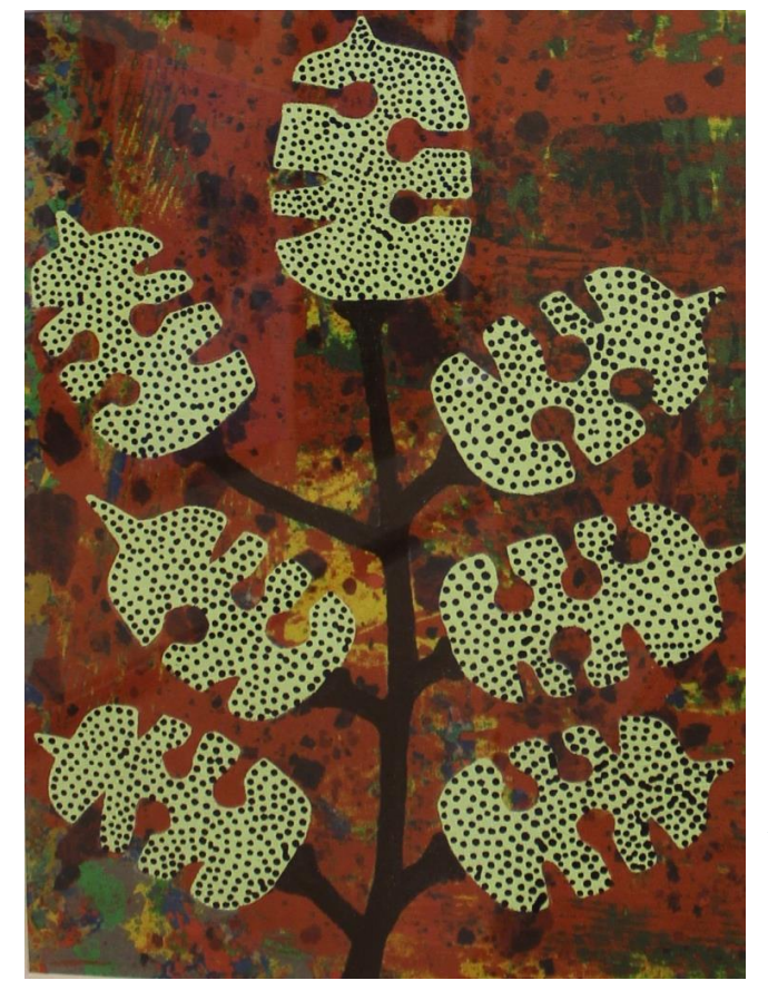
Loren Nibble - Genus Boguse - mixed