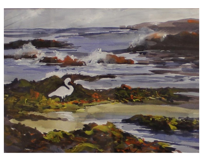
Rick Osgood - Shore Bird in the Seaweed - w/c