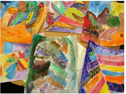
The children were great, and they produced a lot of wild looking Fall leaves!