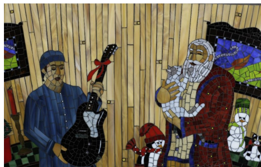
Stained glass by