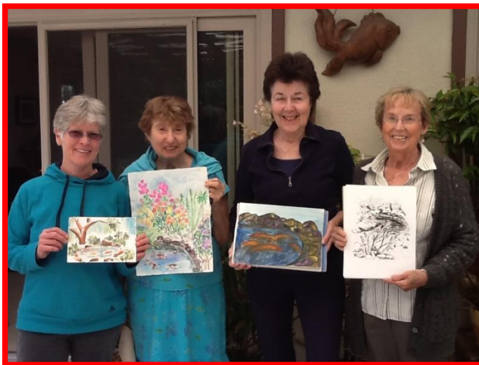
May sketch out at Colleens house.

Questions? Email Holly at hollyh@sbceo.org . or call 805-705-4367.