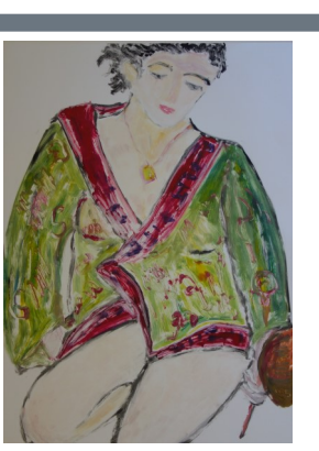
Sanitate right