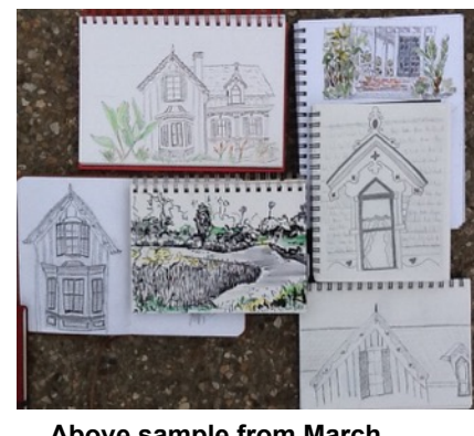
Above sample from March

2016 GVAA ARTIST TOUR This year's GVAA Artist Tour will take place May 14 from 10a-5p. 18 local artists will be showing their work at 5 different Goleta locations. Oil, acrylic, watercolor, collage, jewelry, ceramics, giclées, cards and more will be offered for sale. Stop by, meet the artists and enjoy this popular annual event. The brochure and map can be found at tgvaa.org and at the Goleta Library.