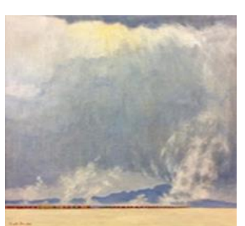
Rick Drake "Across the Salt Flat"