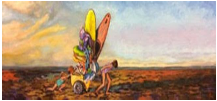
Frances Reighley, "Sunrise Beach Setup"