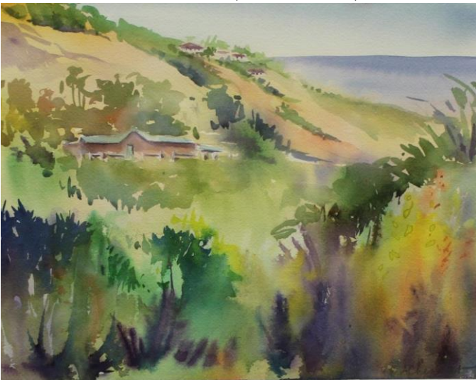
Anne Chesnut, "Island View", w/c