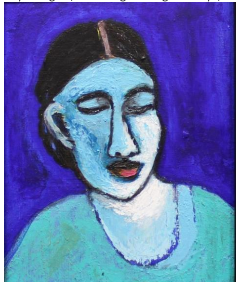
Elizabeth Flanagan, "Reflections In Blue", acrylic