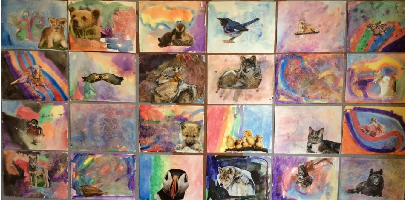
Artwork done by the students from the GUSD Art After School program.