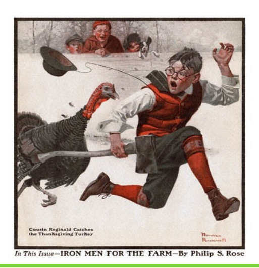
Stow House 2014

Without the energy, enthusiasm and commitment of our participating artists and volunteers, Stow House 2014 could not have happened. Thank you all!