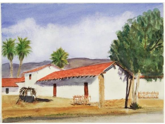
Marjory Water, "The Presidio with Cart", giclée

Cottage Hospital just purchased 2 giclees from Marjory Walter's original paintings to go in one of their new buildings. These will make a total of 7 giclees they've purchased, since they bought 5 others back in 2011.