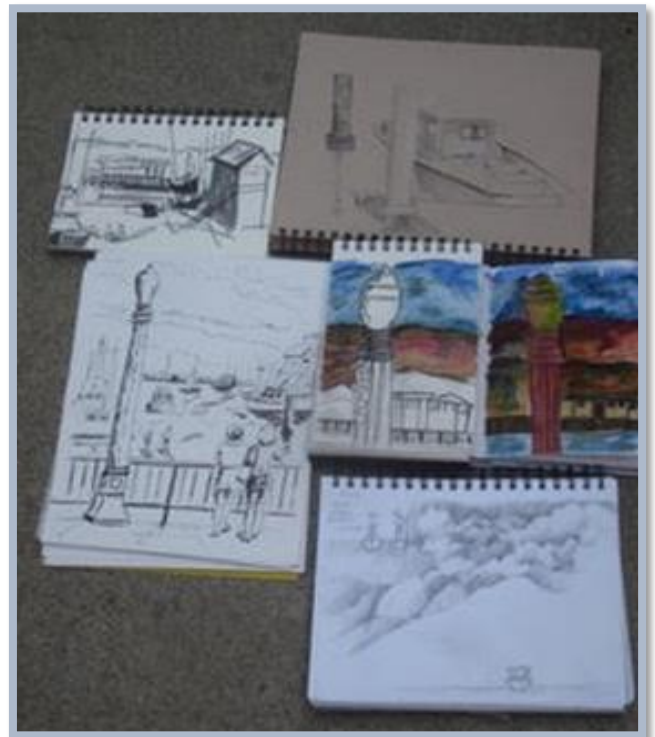
The above photo is a picture of the sketches done for the September Sketch-Out.