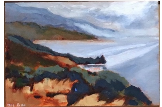
Wild Light by Meg Ricks