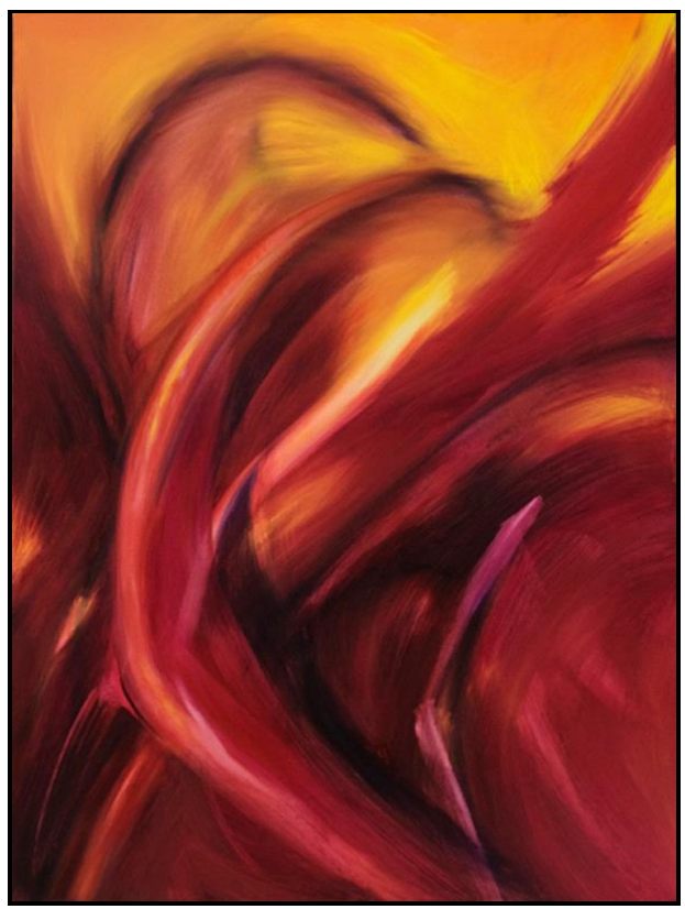
Pamela Benham, Untitled SBE 32, acrylic

Pamela Benham is having a solo exhibition in the Faulkner East Gallery from Nov. 4 to 30. The reception is Thursday, Nov. 7, 5 to 8pm.