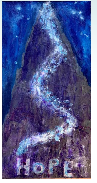
Artist: Merith Cosden [above] Title: "Follow Your Dreams" Dimensions: 36" H x 18" Medium: Acrylic Inspiration: This was a very experi-mental process. The intention is to give hope to the viewer that they can "follow their dreams!"

Artist: Meg Ricks Title: "Faint Hope" [an extra painting for CASA] Dimensions: 30" H x 24" Medium: Oil on canvas