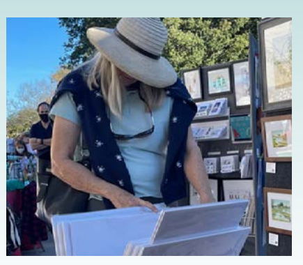
A serious art shopper