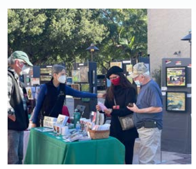
Terre Sanitate (black hat)