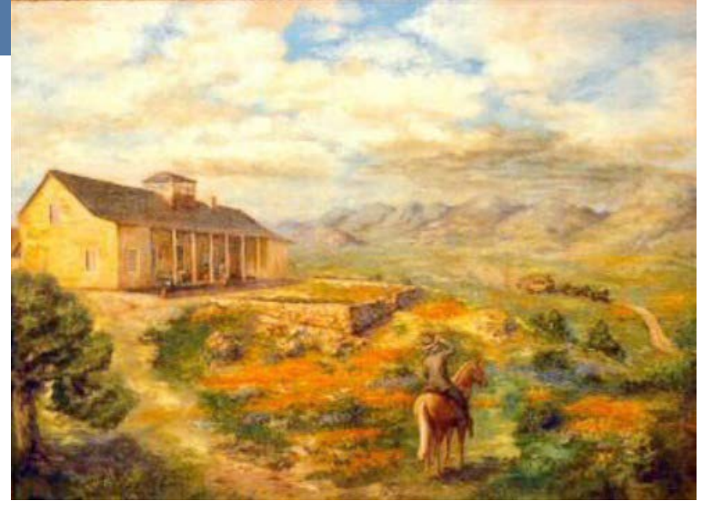
(above: Rancho Nipomo Dana Adobe, historic oil painting)

See Facebook: #womensart #womensvision #artshow