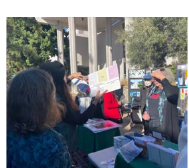
Checking on Sales