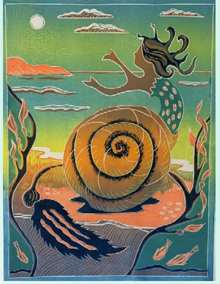
July GVAA News '23 • 4