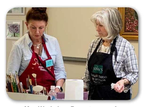
May Workshop Report - page 3