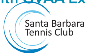
Exhibit Dates: July 4th - September 2nd