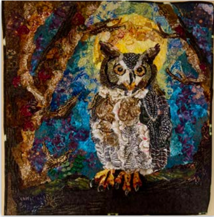
Imperato Owl by Liz Imperato

intuitive search for textiles that show emotion, movement and possibility. I pin fabrics onto cloth in a painterly style, layering shapes and hues in a deliberate and instinctive fashion. Once the designs feel alive and complete, I stitch the pieces together transforming fabric into magical pieces of art. Creating is not just simply a practice for me but an innate biological drive, almost a necessary form of language. Through texture and color, I translate feeling into form. Fabric Collage is my therapy, my meditation and my language.