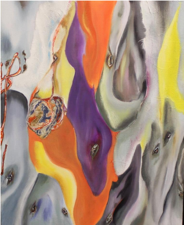
Kathy Reyes , "The Looking Tree", mixed