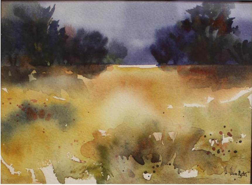
Holly Hungett , "Elwood Mesa Summer", w/c