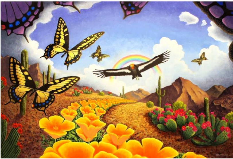
Bruce Birkland, "Condor Bloom", acrylic