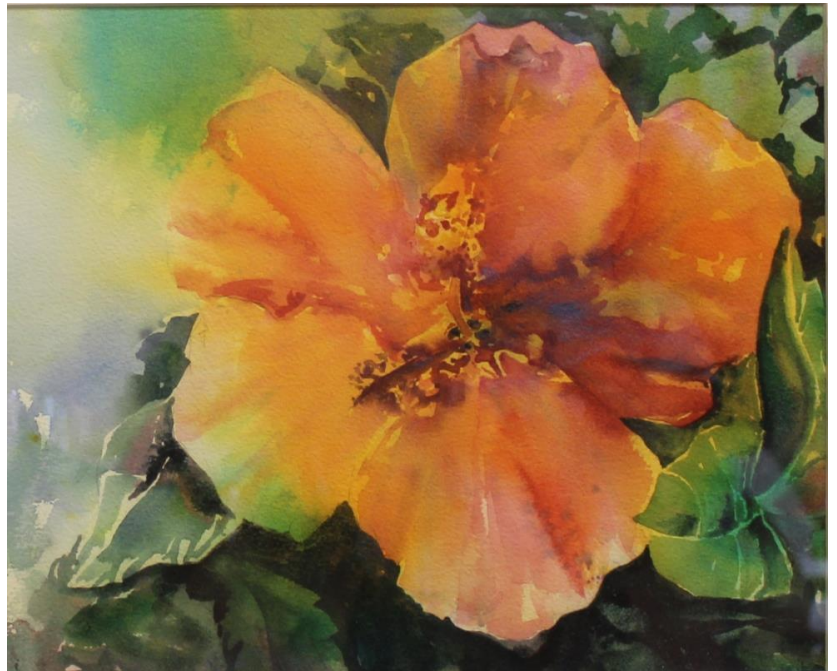
Anne Chesnut, "Singing Color", w/c