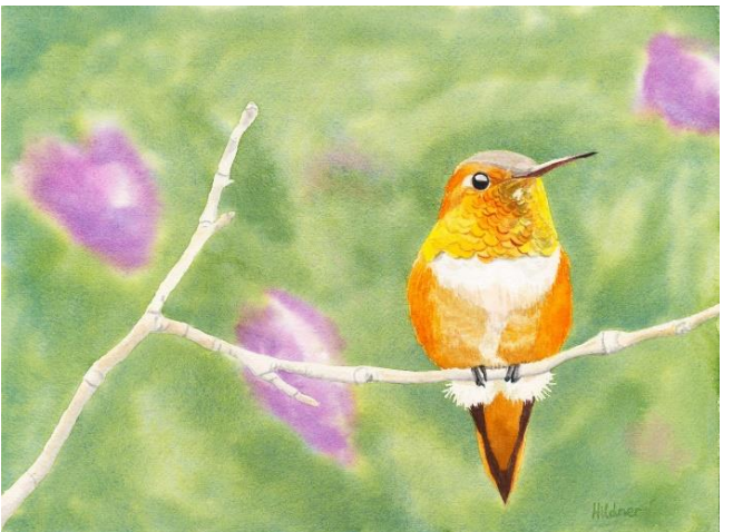
arches 140 lb cold press watercolor paper.