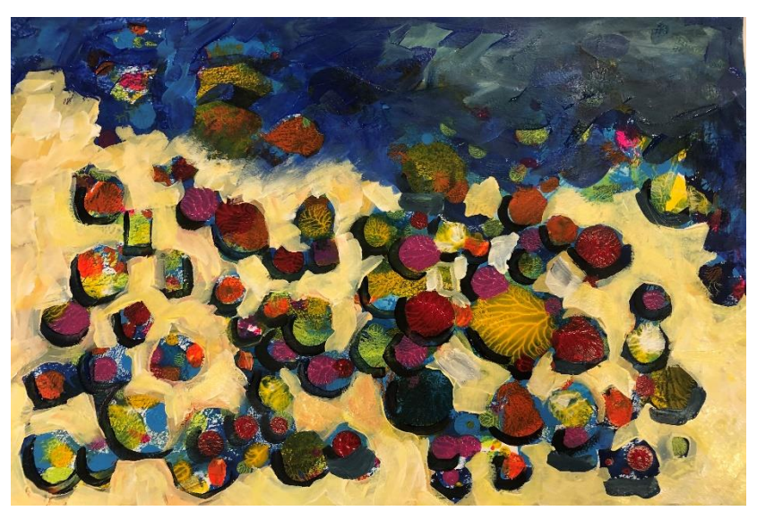
to beach days as a child.