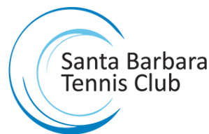
Exhibit Dates: July 4th - September 2nd.