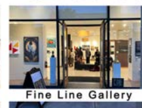
Fine Line Gallery