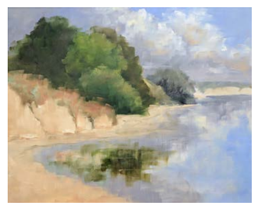
"Goleta Beach" 16 x 10"

I joined GVAA, SBAA and SCAPE and was delighted to win awards and make