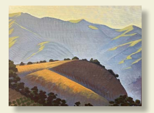
Colin Schildhauer "As Mountains Fade to Blue" oil