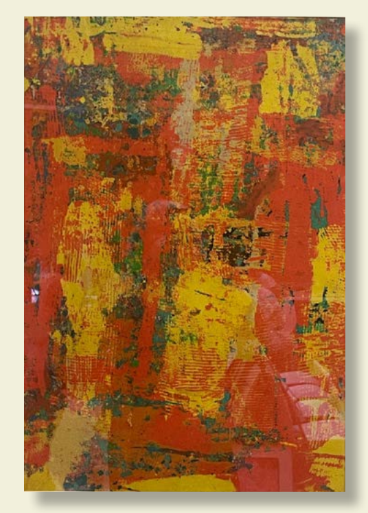
Loren Nibbe ``Jazzy″ Clayprint