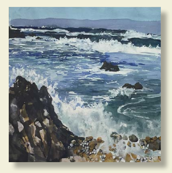
Rick Osgood "Crashing Waves" watercolor