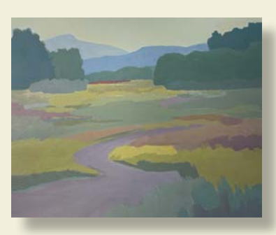
Holly Hungett "View Across the Valley" acrylic