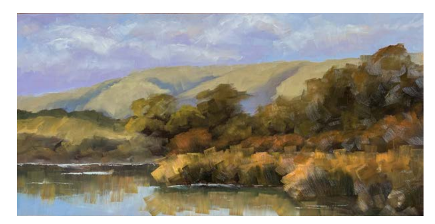
∨ "Lake Los Carneros" 12 x 24"

virtually the only thing I knew about Santa Barbara was the mile from our house to the Society.