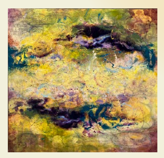
Veronica Walmsley "Sensory Perception" Acrylic