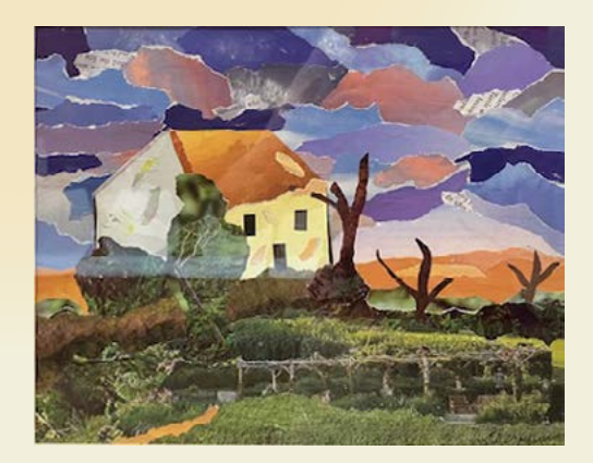
Jo Anne Sharpe "Cottage in Tuscany" Collage