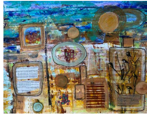
October GVAA News '23 • 6

Pat's "Notes of Autumn in the Air" was juried into the Voice Gallery's Autumn Arias show. 18 x 24" mixed media on gessoed cardboard, shown below. V