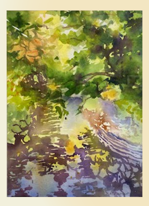
Anne Chesnut "Sun at Play" Watercolor

Five tied Winners for 3rd Choice are shown below.