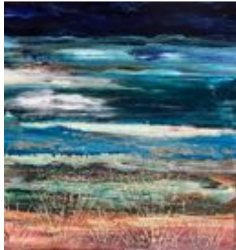
^ “Desert Memories” v “Oasis”