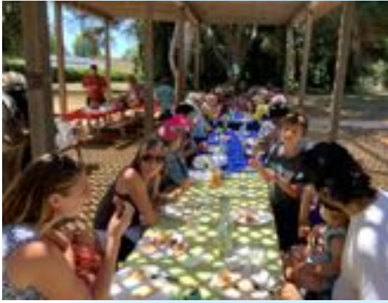
Lunch in the wonderful shade offered at Area 3