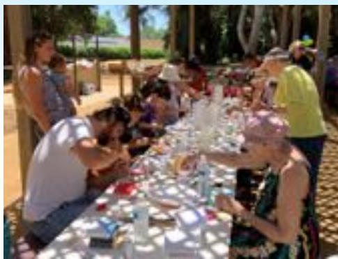
The craft activity had us all engaged.