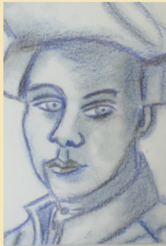
Elizabeth Flanagan, "The Gaze of a Boy", pencil