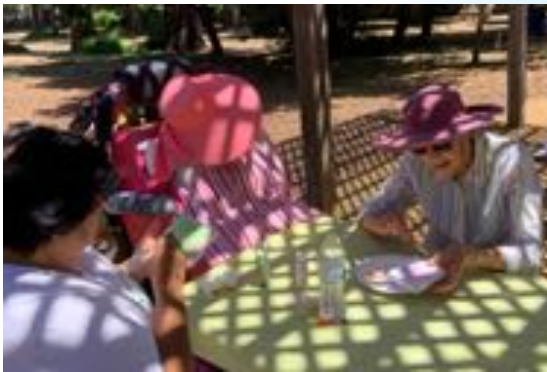
A wonderful time for visiting